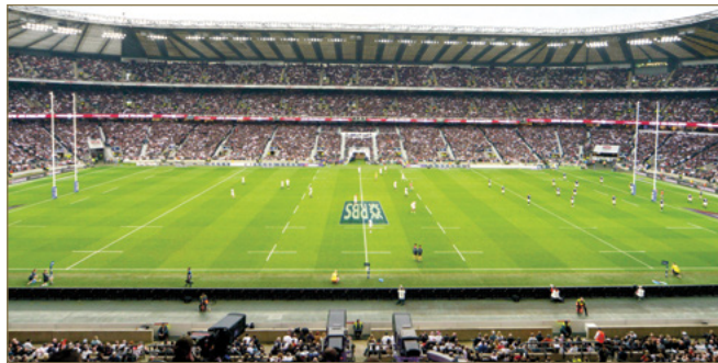
View from seat

Cask ales and draft lager or fine wines specially selected by our in-house sommelier will perfectly complement your menu choice. You and your guests can enjoy a la carte fine dining, light bites or an informal tapas-style service in the company of rugby legends.